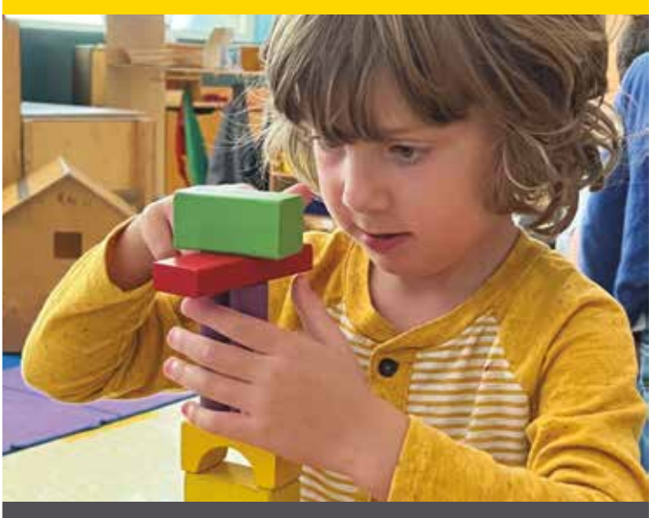
determined • courageous • resourceful

I work through problems and stick with challenges.