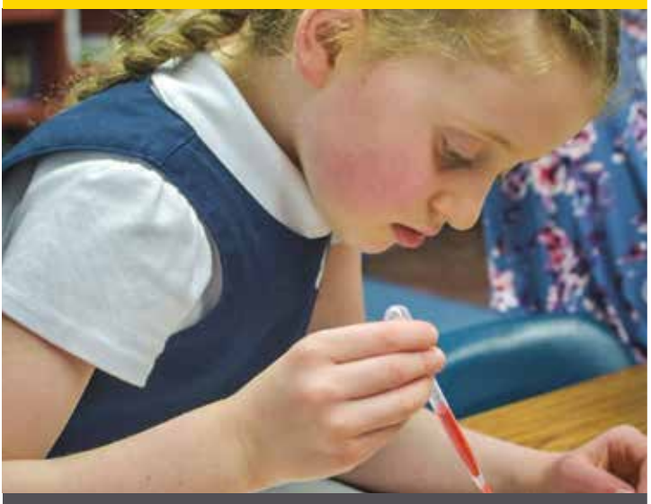
creative • inquisitive • reflective

I create, question and reflect on my learning.